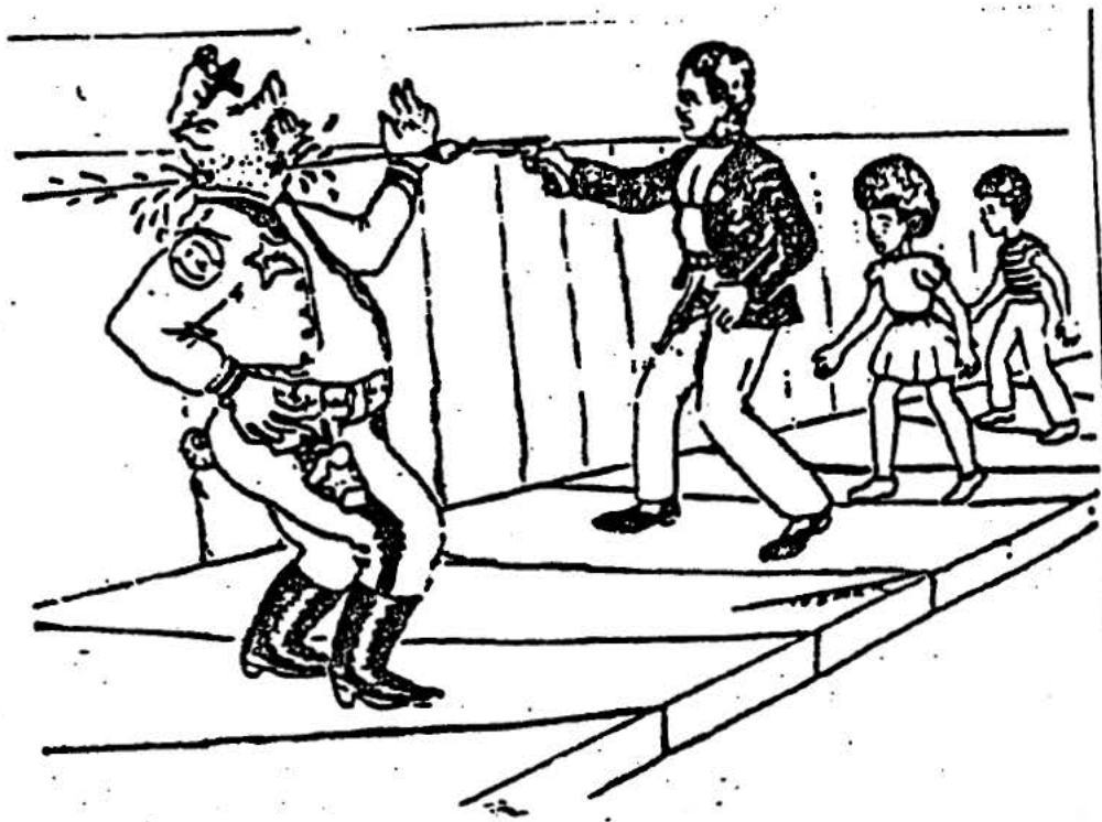
Black Brothers Protect Black Children